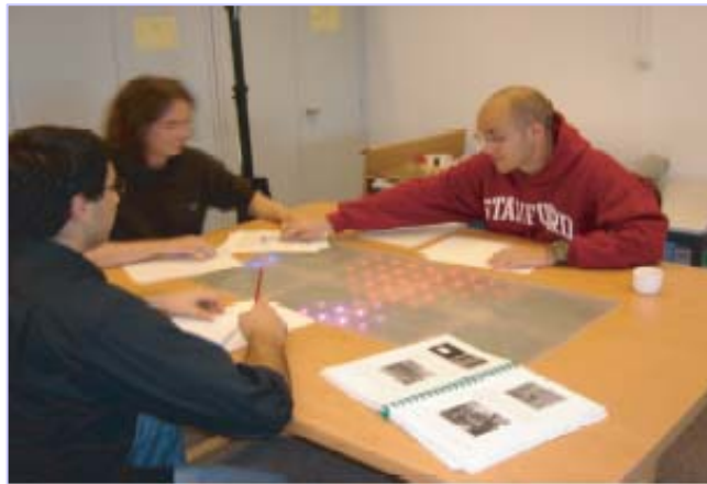
Figure 3. The noise-sensitive table embeds LEDs that reflect interaction patterns

are perceived and aggregated over long periods of time. In figure 3, this mirror can be seen to be embedded in a table (instead of in a screen display), a design choice that illustrates the computing evolution towards physical artifacts (section 2.9).