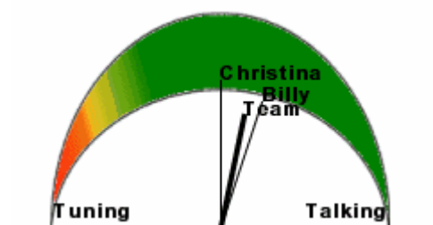
Figure 2. Normative group mirror (Jermann, 2004)

The previous section reviewed the way in which computers are able to analyze group interactions in order to support or even make pedagogical decisions (forming groups, selecting tasks, prompting specific interactions etc.). A simple yet interesting way of using outcomes of such interaction analyses is to display these to the group members. We refer to these tools as "group mirrors", since they reflect some form of external interpretation of the interactions to the users. The pedagogical purpose of group mirrors is to scaffold reflection upon the interaction process itself, and in doing so stimulate the group to regulate the quality of its interaction. Figures 2 and 3 illustrate two examples of group mirrors. The first (Jermann, 2004) is based on a normative model of interaction and provides the group with an indication of what is expected of the members in order to ensure effective collaboration. In pre-experiments, Jermann established that effective pairs show a higher ratio between the number of utterances between the users and the number of user actions on the interface ("tuning" the simulation parameters). This talk/tune ratio, although very simple, was significantly related to group effectiveness and hence used as group mirror.